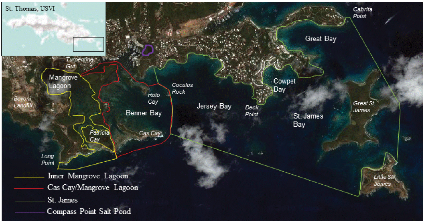
Figure 1. Individual Reserves that comprise the STEER.

for juvenile fish and other organisms among the mangrove roots (DPNR-DFW, 2005). The extensive areas of seagrass in Benner and Jersey Bays provide habitat for many organisms including juvenile fish, and are an important food source for fish, turtles, birds and sea urchins. Conch feed off the epiphytes on the seagrass leaves (DPNR-DFW, 2005). The STEER also contains significant patch and fringing coral reef areas in Jersey Bay and in an area just south of Cas and Patricia Cays, along with St. James Bay. Species of coral found in the STEER include boulder star coral ( Montastraea annularis ), brain corals ( Diploria spp. ), various species of Porites , and staghorn coral ( Acropora cervicornis ) (DPNR-DFW, 2005). The STEER is thought to be one of the most valuable nursery areas remaining in St. Thomas, with numerous species of fish and shellfish spending some portion of their lives in the protected areas around the mangrove roots and in the seagrass beds (STEER, 2011).