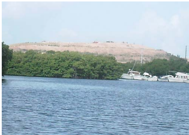
The Bovoni Landfill in the western end of the STEER receives solid waste from both St. Thomas and St. John.

There appear to be few published studies quantifying concentrations of the types of compounds analyzed for this project, particularly in the US Caribbean. The concentrations of stormwater contaminants estimated from this study are compared with recent results from St. John USVI, South Florida, California and also from the northwest Mediterranean Sea.