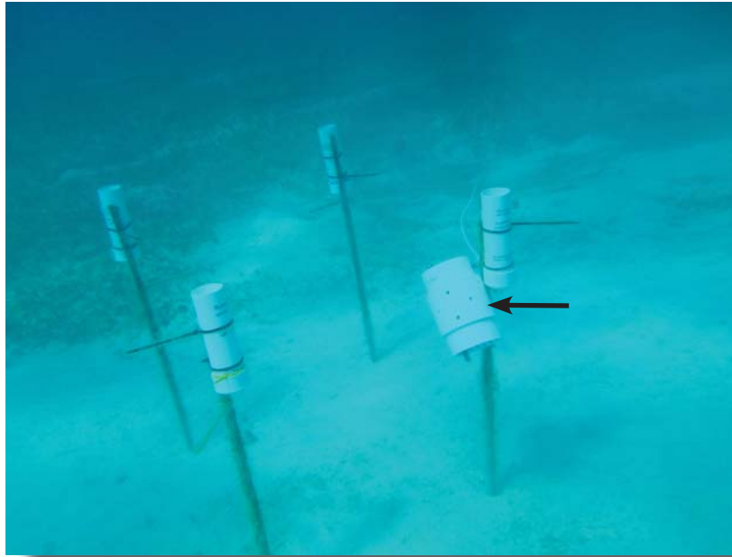
Figure 5. POCIS deployment canister (arrow) among the sediment traps at a site in the STEER.

ment in Turpentine Gut, one field blank was used. After a POCIS deployment canister entered the water, the POCIS field blank was placed back in its protective canister (solvent-rinsed metal container also used for shipping), sealed and then returned to UVI and placed in a freezer.