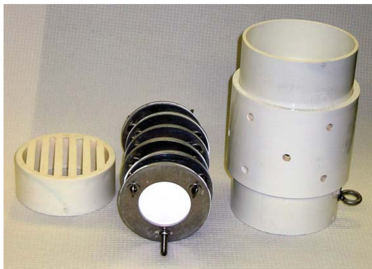
Figure 3. A disassembled POCIS deployment canister with the POCIS disks.

As part of some preliminary work in 2010, a POCIS deployment canister was placed in Turpentine Gut, the only perennial stream in St. Thomas (Nemeth and Platenberg,