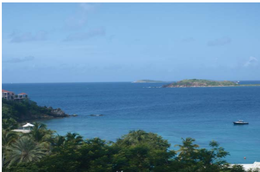
View into the St. Thomas East End Reserves (STEER).