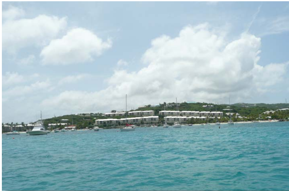
View into Cowpet Bay, within the St. Thomas East End Reserves (STEER).

Within the STEER there are extensive mangroves and seagrass beds, along with coral reefs, lagoons and cays. The largest remaining mangrove system in St. Thomas occurs along the shores of Mangrove Lagoon/Benner Bay (IRF 1993). Mangroves offer many ecological benefits including natural buffers against shore erosion and shelter