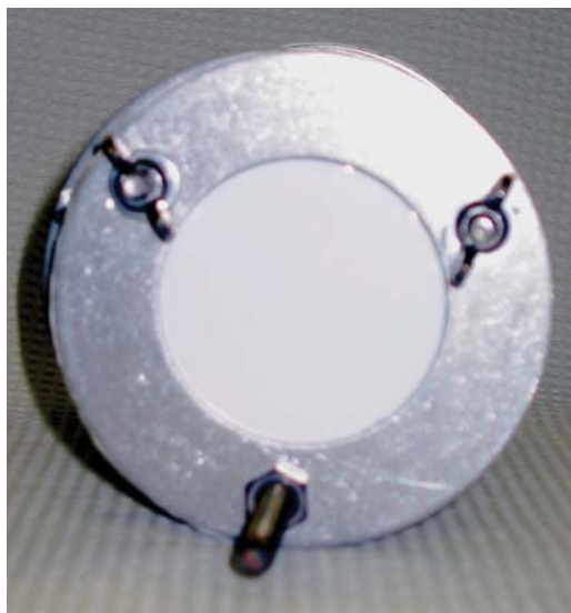
Figure 2. Example of a POCIS disk.

The POCIS (Figure 2) is a disk consisting of a sorbent matrix sandwiched between two membrane sheets (Alvarez et al., 2008). The porous membrane sheets allow water to flow through the sorbent, enabling the sorbent material to sequester (accumulate) the contaminants of interest. The sorbent matrix can be tailored to the types of chemical contaminants of interest (e.g., stormwater chemicals or human use pharmaceuticals). For deployment, the POCIS disks are assembled onto a frame and then placed in the deployment canister (Figure 3).